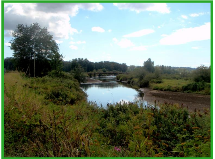
Open areas from floodplains to alpine meadows, frequently near water, provide habitat features for Barn Swallow.

Barn Swallows construct nests formed from mud pellets that may be collected from riverbanks, wetlands or exposed soils up to a kilometer from the nest site. Nests are lined with grass, animal hair, and feathers. Nests built on man-made structures (e.g. under eaves, bridges, docks) require a ledge to support the nest, a vertical wall to which the nest can be attached and a roof or overhang to protect from precipitation.