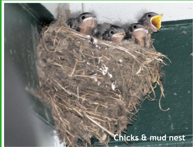
Chicks & mud nest

Notes on Hirundo rustica : This gregarious member of the family Hirundinidae (swallows and martins), is often associated with noisy colonial nesting sites in barns and under the eaves of buildings. A neotropical migrant, over-wintering in Central America and Mexico, Barn Swallow in BC migrate via Washington State and the Pacific Flyway. The only member of the genus Hirundo in BC, Canadian Breeding Bird Survey data suggests Barn Swallow have experienced a 2.9% annual decline over the past 30 years, a decline that has steepened in the last decade to 7.6% annually.