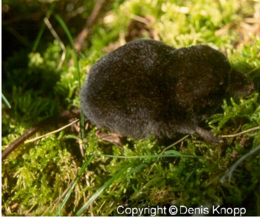
xsʔətətət Pacific Water Shrew