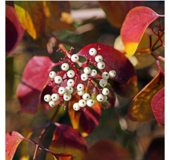
Red Flowering Currant

*Capitalized words are Halq'eméylem, lower case words are hə́nqə́miḥə́m. Traditional place and species names provided by knowledge keepers and speakers from the Kwantlen and Katzie Nations.