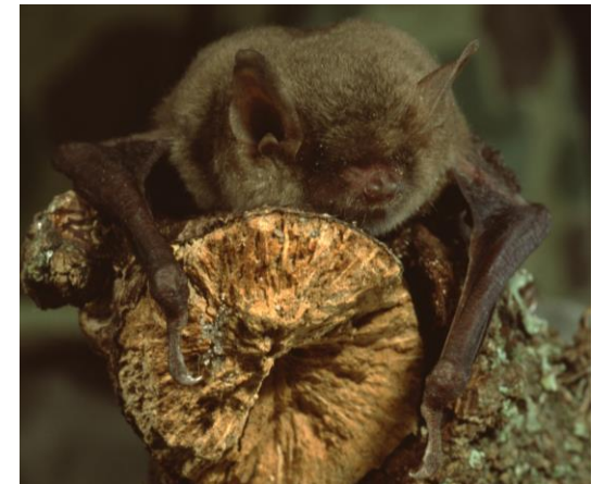
Little Brown Myotis

*Capitalized words are Halq'eméylem, lower case words are hə́qəmiñəm. Traditional place and species names provided by knowledge keepers and speakers from the Kwantlen and Katzie Nations.