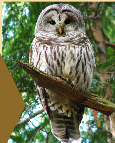
Hoots "Who cooks for you."