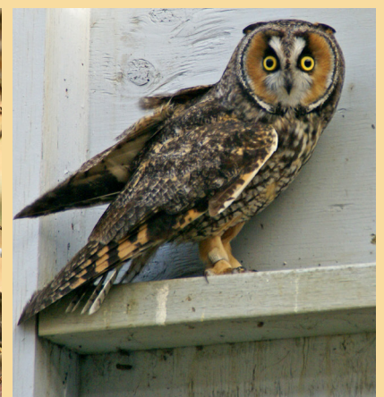
Orange face with long ear-tufts.