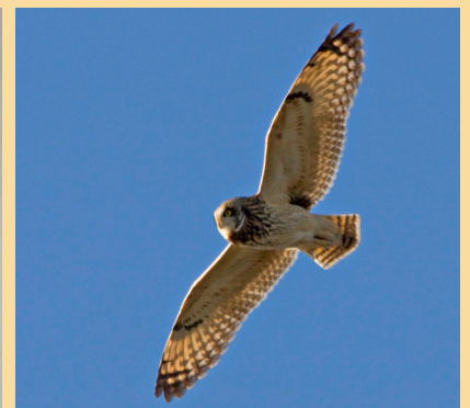
Flaps with stiff beats, making their flight buoyant like a butterfly.