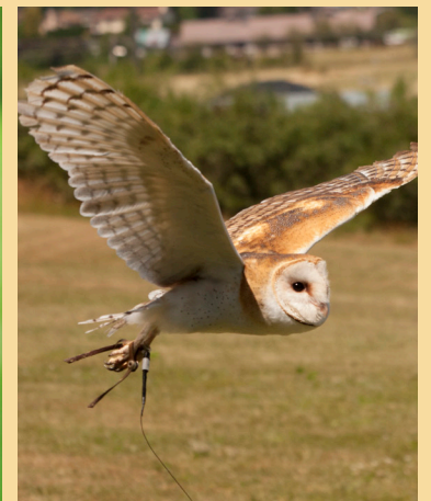
Long wings relative to body.