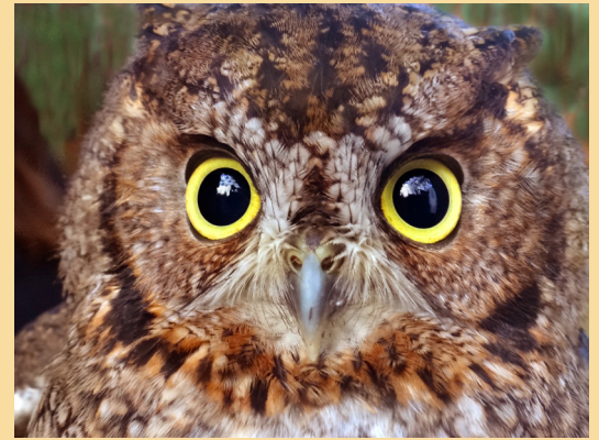
Well camouflaged with small ear tufts.