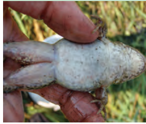
Oregon Spotted Frog

Colouration not distinctive. Ranges from white-grey mottled to bright red.