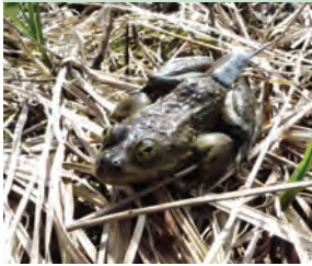
Oregon Spotted Frog

Generally sits in crouched position, unless preparing to jump.