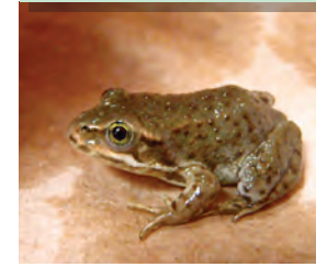
Oregon Spotted Frog

Generally sits crouched. Dorso-lateral folds vague on lower back.