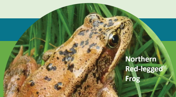
Northern Red-legged Frog

Review the links in this guide to learn about amphibian species habitat needs. Additional information can be found through the Province of BC's Amphibians in BC webpage .