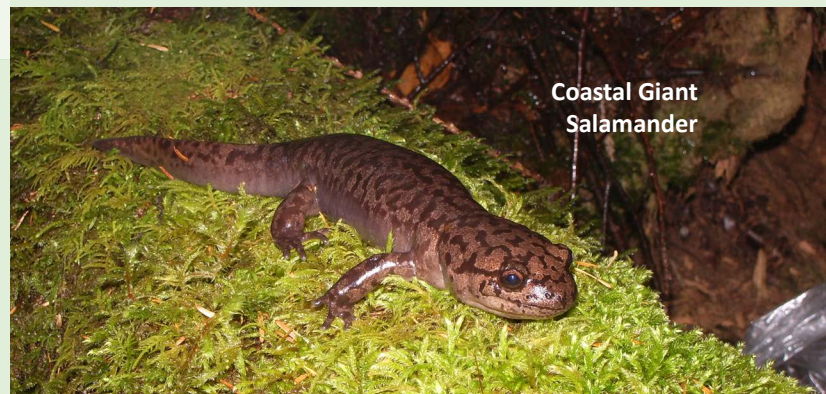
Coastal Giant Salamander

For more information on regulations, conservation strategies, assessment/listing of risk status and species at risk profiles: