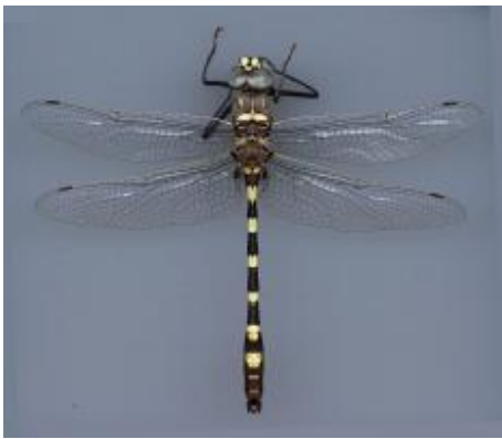
Male

A member of the family Macromiidae (“Cruiser” dragonflies), sometimes considered a sub-family of Libellulidae (“Skimmer” dragonflies”). Members of this family skim or cruise along open water, often down the middle of rivers or streams or along the shores of lakes. They can also be seen exhibiting similar behavior on roads.