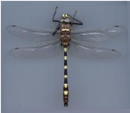
Male

A member of the family Macromiidae ("Cruiser" dragonflies), sometimes considered a sub-family of Libellulidae ("Skimmer" dragonflies"). Members of this family skim or cruise along open water, often down the middle of rivers or streams or along the shores of lakes. They can also be seen exhibiting similar behavior on roads.