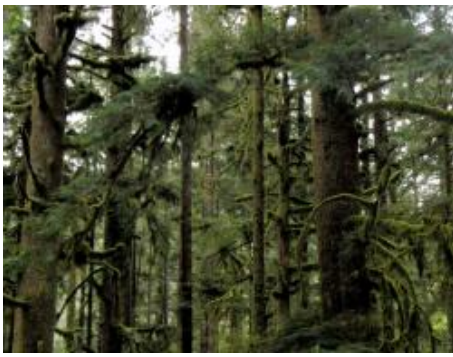
Dwarf mistletoe infected hemlock