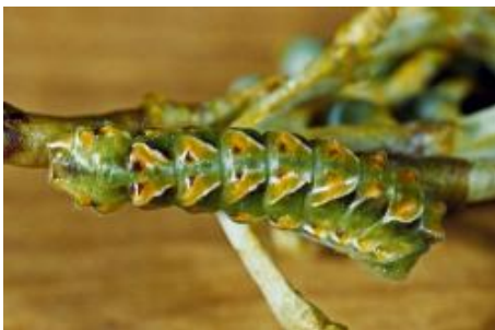
Larva