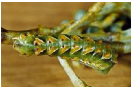
Larva