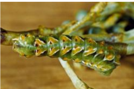
Larva