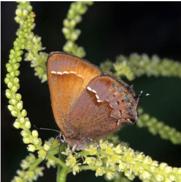
Cedar Hairstreak Ian Lane

The more common Cedar Hairstreak, though much smaller, overlaps in distribution and is the most likely species to be confused with Johnson’s Hairstreak. The ventral wing pattern of Cedar Hairstreak appears washed out compared to Johnson’s Hairstreak and the ventral jagged white line, which runs midway along both sets of wings, is bordered with amber instead of black.