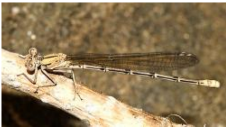
Female Tom Murray

A member of the family Coenagrionidae (“Closed-winged, Narrow-winged” or “Pond” damselflies), with approximately 1,100 species. Members of the genus Argia are collectively referred to as “Dancers.” Wings are held closed and tight to the body when resting. Argia species are often associated with flowing water.