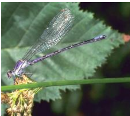
Male Ian Lane