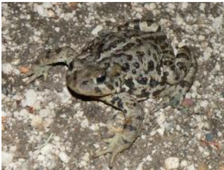
Adult

A member of the family Bufonidae (“true toads”), true toads are toothless and generally “warty” in appearance and have a “parotoid” gland that excretes an alkaloid poison “bufotoxin” when the animal is stressed.