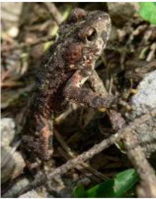
Juvenile ("Toadlet") Walter Seigmund