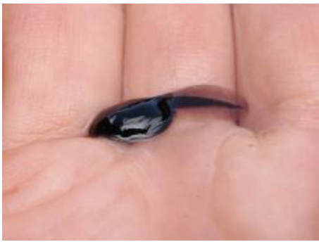
Tadpole Pamela Zevit