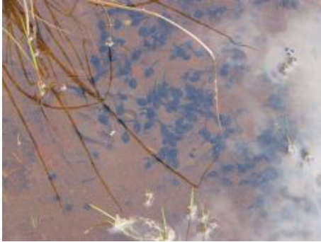
Tadpoles massing Pamela Zevit