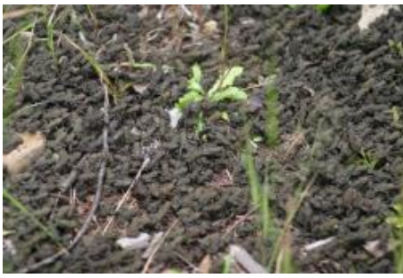
Juvenile ("Toadlet") mass migration Rod Gilbert