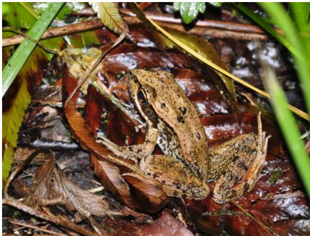
Northern Red-legged frog juvenile Gord Gadsden

Juvenile toads (“toadlets”) could be confused with the juvenile Northern Red-legged Frog or Coastal Tailed Frog, especially where distribution of these species overlaps. Western Toad tadpoles have been found associated with fast flowing streams similar to those utilized by Coastal Tailed Frog tadpoles, which can also be black and similar in size in early stages of growth. Rearing in flowing water habitats, while unusual, may reflect localized adaptations by some Western Toad populations.