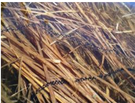
Egg mass