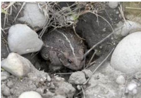
Adult in burrow Rod Gilbert